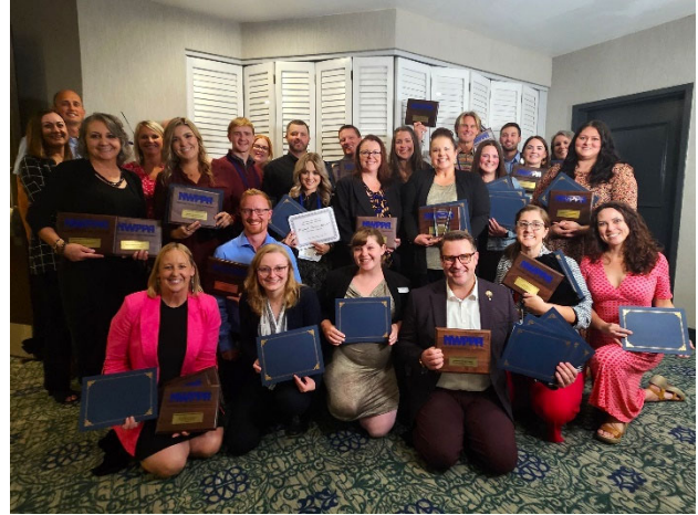
2024 Excellence in Communications winners