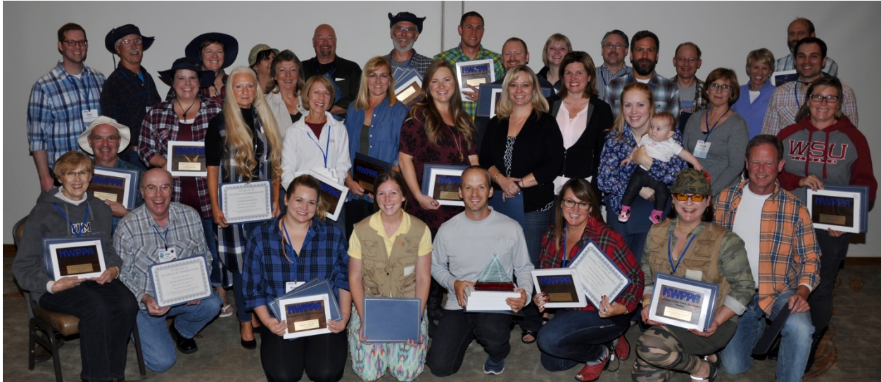
The 2016 Excellence in Communication winners at Tuesday evening's camping-themed awards banquet.

Vancouver, Wash. – Now in its 23 rd year, the Excellence in Communication contest recognizes the top communication efforts from Northwest Public Power Association (NWPPA) member utilities and associations. NWPPA presented the 2016 Excellence in Communication awards at its Northwest Communications & Energy Innovations Conference (NIC) awards banquet at the DoubleTree Hotel in Missoula, Mont., on Tuesday, September 13.